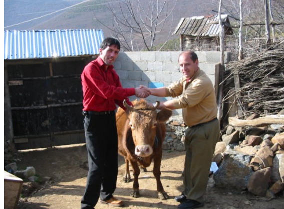
Mine victim benefiting from socio-economic reintegration