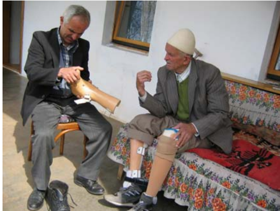
Prostheses repair technician in field (CBR project)