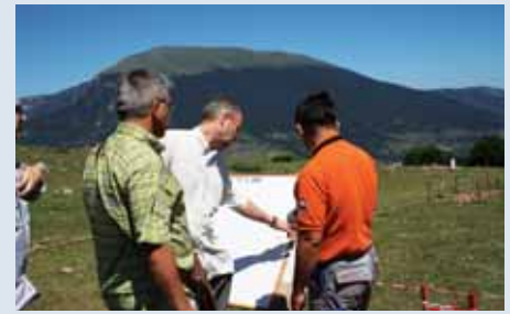
Swiss expert during a field visit, Kukës

The Albanian Mine Action Programme (AMAP) has been strongly supported by international donors such as the Governments of Austria, Canada, Czech Republic, Denmark, France, Germany, Luxembourg, Norway, Slovenia, Sweden, Switzerland, Turkey, United Kingdom (DfID), United States and the European Commission, ICRC, UNDP and UNICEF. In particular, UNDP and the International Trust Fund (ITF) in Slovenia have played a crucial role in building the capacities of AMAE and of the National Clearance Capacity, through the provision of adequate technical support and