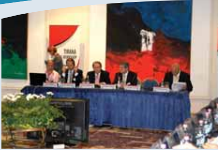
Chairman of AMAC at the Tirana Regional Workshop on a Mine Free Southeastern Europe, October 2009