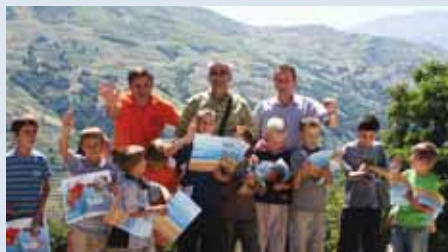
Risk Education Activities

A serious consequence of the mines contamination was the impact on integrated border management along the Albanian/Kosova border making it difficult a proper patrolling and prevention of trafficking and other crimes. Since the end of the conflict, 13 police officers were wounded by mines and UXO during the execution of their duties. The removal of this threat significantly enhanced the management of the Albanian northeastern border. Even though most people were informed and educated still they were daily posed to the mine threat mainly because of the economic pressure. Since 1999, 210 accidents have oc-