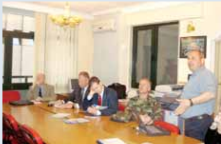
Visit of US DoS representatives at AMAE office.