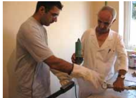
Prosthetic Workshop in Kukes Regional Hospital

tainable national response to the PMR needs of mine victims and other people in need. • ICRC supports the National Prosthetic Orthotic Center (NPOC) in Tirana with raw materials and with monitoring/coaching visits. A specialized technician is back at the NPOC after a 3-years training abroad at ISPO Level II, improving the capacities of the center. • Equipments and raw materials were supplied to the NPOC with funds provid-