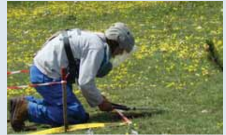
Manual Demining by DCA

tion in Northeast Albania for productive use. As a result, 12,452 anti-personnel mines, 152 anti-tank mines and 4,965 unexploded ordnance have been found and destroyed in these areas.