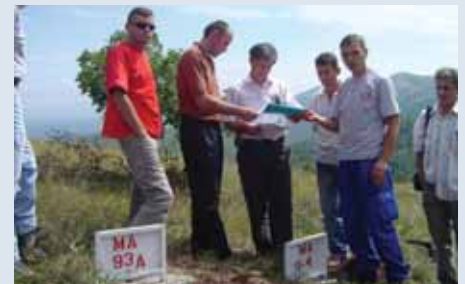
Handover Ceremony of cleared land

In 2006, a local clearance capacity with 6 manual clearance teams was fully established under management of DanChurchAid through a project funded by the European Commission through UNDP Albania. From 2007 onwards DCA has op-