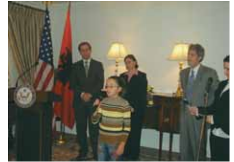
Night of a Thousand Dinners

tainable national response to the PMR needs of mine victims and other people in need. • ICRC supports the National Prosthetic Orthotic Center (NPOC) in Tirana with raw materials and with monitoring/coaching visits. A specialized technician is back at the NPOC after a 3-years training abroad at ISPO Level II, improving the capacities of the center. • Equipments and raw materials were supplied to the NPOC with funds provid-