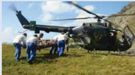
MEDEVAC support - AAF

The Government of Albania established since 1999 the framework for the Albanian Mine Action Programme (AMAP). Policy and strategy was developed by the Albanian Mine Action Committee (AMAC) and executed by the Albanian Mine Action Executive (AMAE). In-kind and material support from the Albanian Government from 1999 until 2009 to the