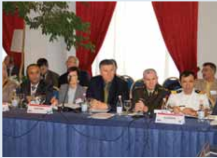
Albanian Delegation at the Tirana Regional Workshop on a Mine Free Southeastern Europe, October 2009