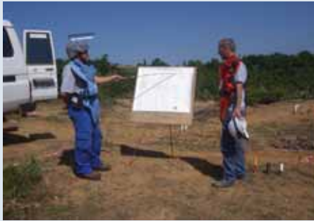
AMAE Quality Management Operations

The National Mine Action Strategy, established since 2002 and revised regularly es-