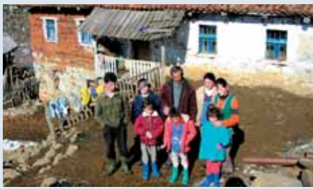
Sight-impaired victim with family

The mine/UXO contamination covered areas in Kukës Prefecture, northeast of Albania, which is amongst the poorest regions in the country. The main activities are grazing, farming, gathering firewood, and other subsistence livelihoods. Thirty nine villages were originally affected in northeast Albania with about 25,000 people directly affected. The mines problem had an impact on infrastructure development and the environment by becoming an obstacle for the development of eco-tourism in the region.