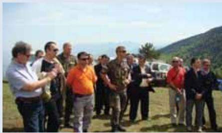
Donors Field Trip in Kukës Region

ly eliminate the threat of mines and unexploded ordnance in Northeast Albania. AMAE's responsibilities include coordination and monitoring of all mine action activities in the