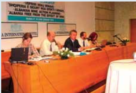
National Mine Action planning Workshop

ly eliminate the threat of mines and unexploded ordnance in Northeast Albania. AMAE's responsibilities include coordination and monitoring of all mine action activities in the