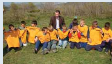
School Children during MRE session

erated with a fully nationalized programme and only one expatriate Programme Manager. The clearance operations have been funded throughout these years mainly by US State Department,