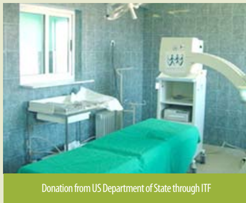
Donation from US Department of State through ITF