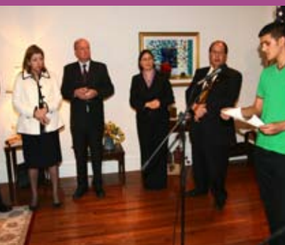
Night of 1000 Dinners 2009 hosted by US Embassy in Tirana