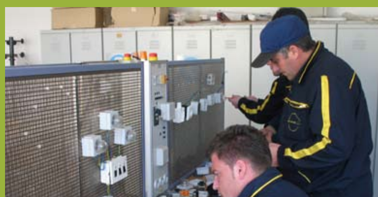
Survivors benefiting from the socio-economic reintegration projects

lar training is provided to the technicians at the NPOC in Tirana, Kukes and Pogradec. Since 2005 more than 300 amputees/cases repaired their prostheses at the Kukes Prosthetic Workshop. Since 2001, with US DoS support through ITF, 130 mine/UXO amputees classified as difficult cases have received prostheses abroad. Nurses in the mine affected villages as well as the physiotherapists and neurologist from Kukes Hospital are part of the CBR network to facilitate mine survivors' access to medical and social services.