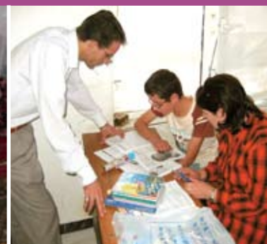
Children supported with extra classes through N1KD projects