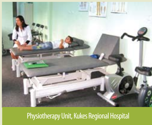
Physiotherapy Unit, Kukes Regional Hospital