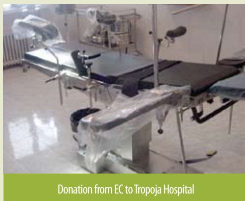
Donation from EC to Tropoja Hospital

tion unit) received medical training from the Regional Hospital in 2003/4 and in 2009, funded by US DoS through ITF. With the support of the French Government 2 physiotherapists from Kukes and Tropoja Hospitals and 6 nurses from mine affected villages received refresher training at the Slovenia Institute for Rehabilitation. Additionally, the nurses working in the mine affected villages as well as the physiotherapists at Kukes Hospital were equipped with medical supplies/equipment.