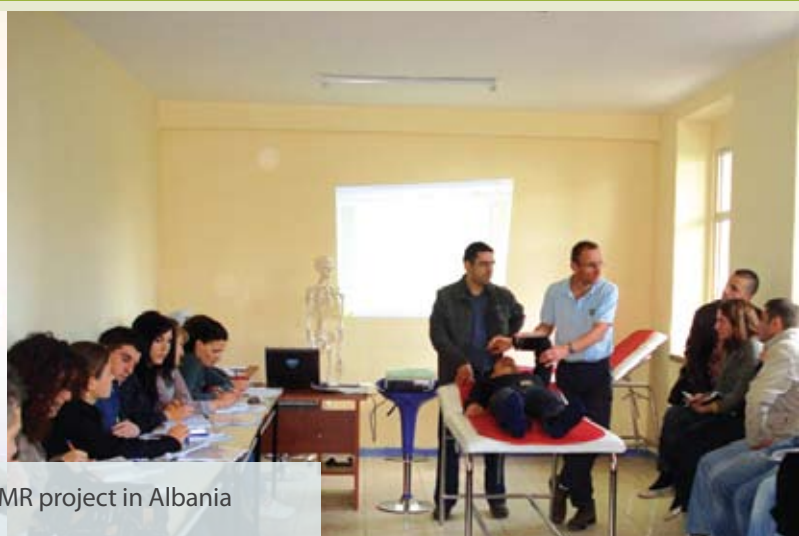
Activities from the PMR project in Albania