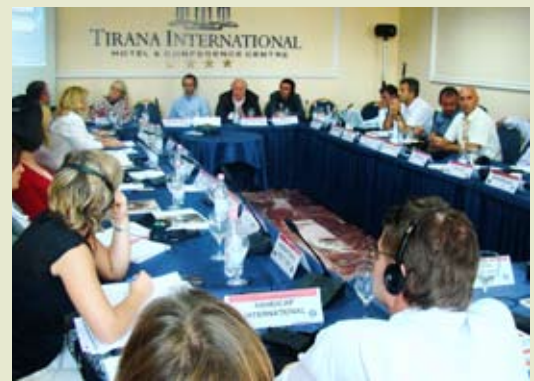
Parallel Programme for Victim Assistance at Tirana Regional Workshop on a Mine Free Southeastern Europe, October 2009