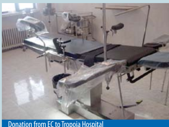
Donation from EC to Tropoja Hospital

as medical training provided to 4 medical specialists (including the surgeons) from the Regional Hospital in 2003/4 and in 2009, funded by US DoS through ITF. With the support of the French Government 2 physiotherapists from Kukes and Tropoja Hospital and 6 nurses from mine affected villages received refresher training at the Slovenia Institute for Rehabilitation and medical supplies/equipment are provided for the nurses working in the mine affected villages as well as the physiotherapists at Kukes Hospital.