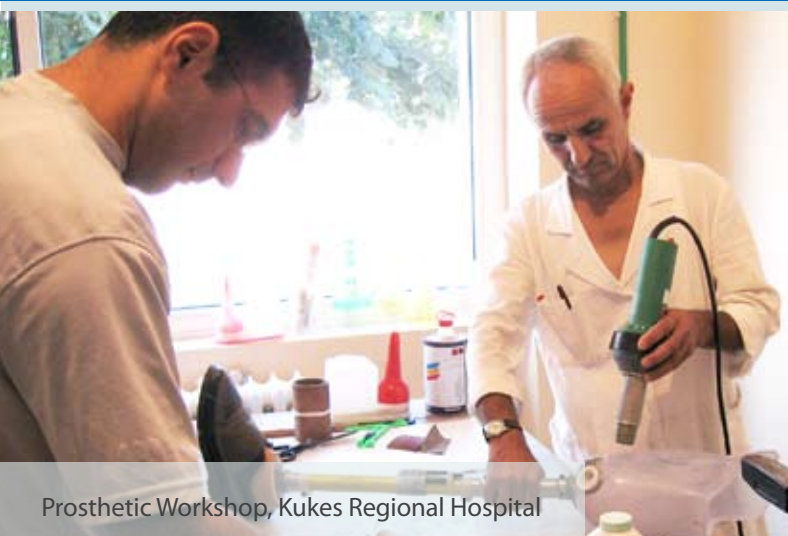
Prosthetic Workshop, Kukës Regional Hospital