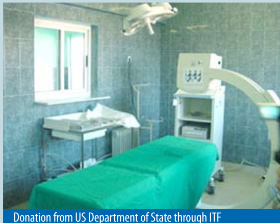
Donation from US Department of State through ITF