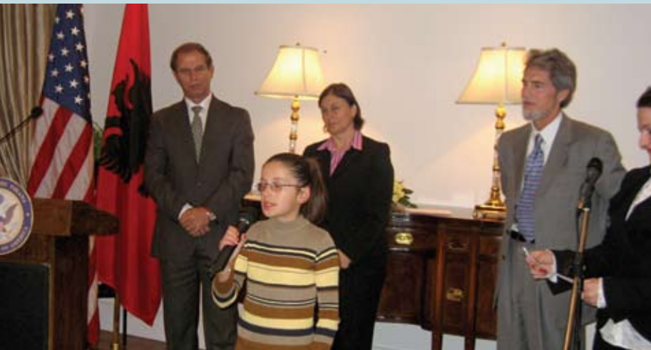
Night of 1000 Dinners 2007 hosted by US Embassy in Tirana