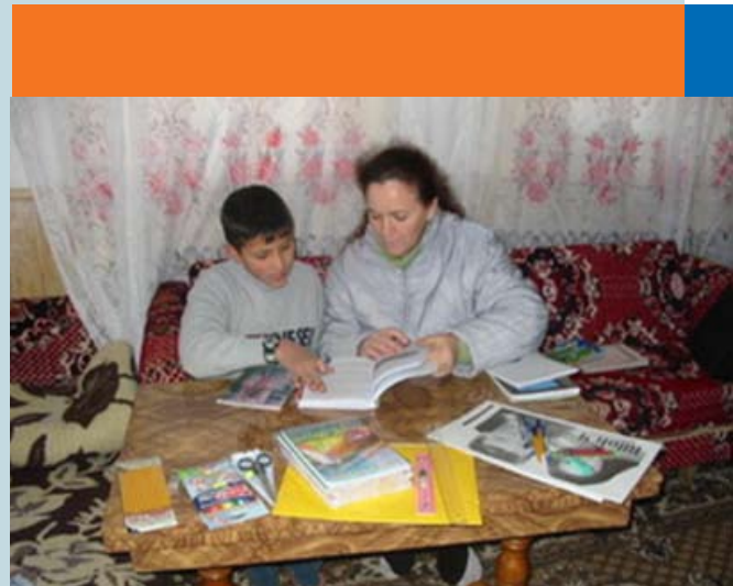
Children supported with extra classes through N1KD projects