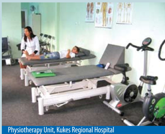
Physiotherapy Unit, Kukes Regional Hospital