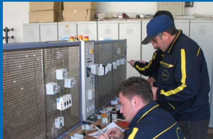
Survivors benefiting from the socio-economic reintegration projects

DoS support and regular training is provided to the technicians at the NPOC in Tirana, Kukes and Pogradec. Since 2005 more than 250 amputees/cases repaired their prostheses at the Kukes Prosthetic Workshop. Since 2001, with US DoS support through ITF, 130 mine/UXO amputees classified as difficult cases have received prostheses abroad. Nurses in the mine affected villages, as well as the physiotherapists and neurologist from Kukes Hospital, are part of the CBR network to facilitate mine survivors' access to medical and social services.